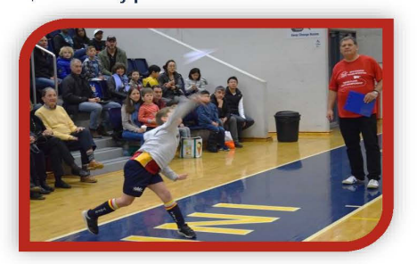
State Championships held at the Sydney University Sports and Aquatic Centre, Bryden's Showcourts: a University of Sydney Open Day Event

For more details: www.paperplanes.youngscientist.com.au